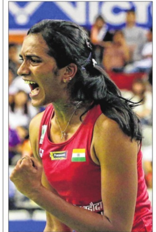
FINALE: P.V. Sindhu, after defeating Nozomi Okuhara of Japan 22-20 11-21 20-18 in a thrilling summit clash to clinch the women's singles title in the Korea Open Super Series in Seoul on Sunday. See Page 20 for full report

State funeral, flypast for Marshal Arjan Singh NEW DELHI: A state funeral will be accorded to Marshal of the Indian Air Force Arjan Singh and the national flag will fly at half-mast at all government buildings on Monday. The last rites of Arjan Singh, who passed away at the Army's Research and Reference Hospital, would be performed at Brar Square at 10 am on Monday. The Defence Ministry said Singh's mortal remains will be taken to the funeral site from his residence in a gun carriage procession. It said a gun salute will be given and a flypast will be organised before the final rites, weather permitting. Arjan Singh, the hero of the 1965 India-Pakistan war and the only Air Force officer to be promoted to five-star rank, died here at the age of 98.